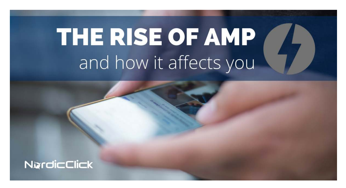
The Rise of AMP & How It Affects You

Google aims to provide the best experience for mobile searchers. Learn how their AMP technology helps and whether it may be a good fit for your website.