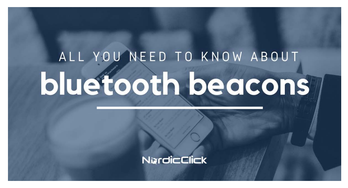
All You Need to Know About Bluetooth Beacons

Site visitors who use internal search are statistically more likely to convert. Learn 5 ways to improve the experience and turn searchers into converters.