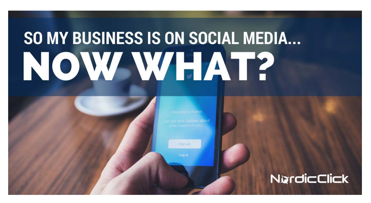
So My Business Is On Social Media... Now What?

People only interact with big brands on social, right? Wrong! Practice these 7 things to use your business' social platforms to connect with real people.