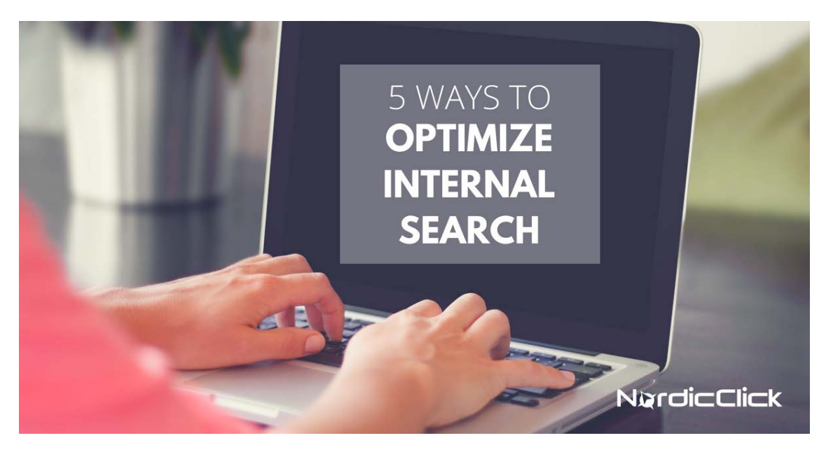
5 Ways to Optimize Your Internal Search

Site visitors who use internal search are statistically more likely to convert. Learn 5 ways to improve the experience and turn searchers into converters.